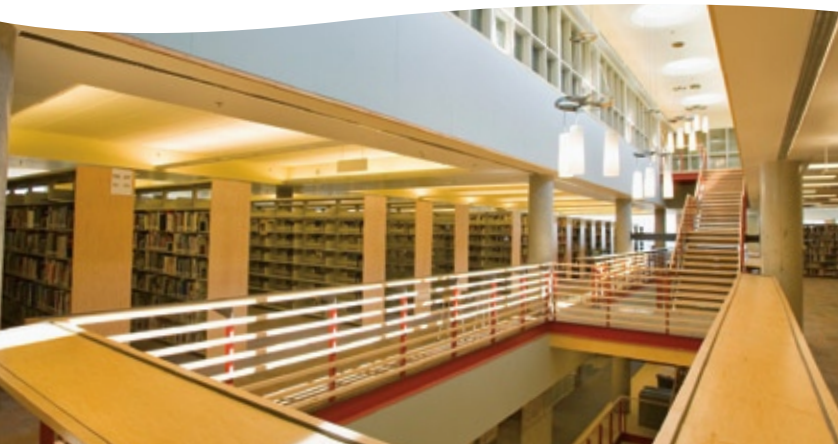
58,577 sq.ft Library