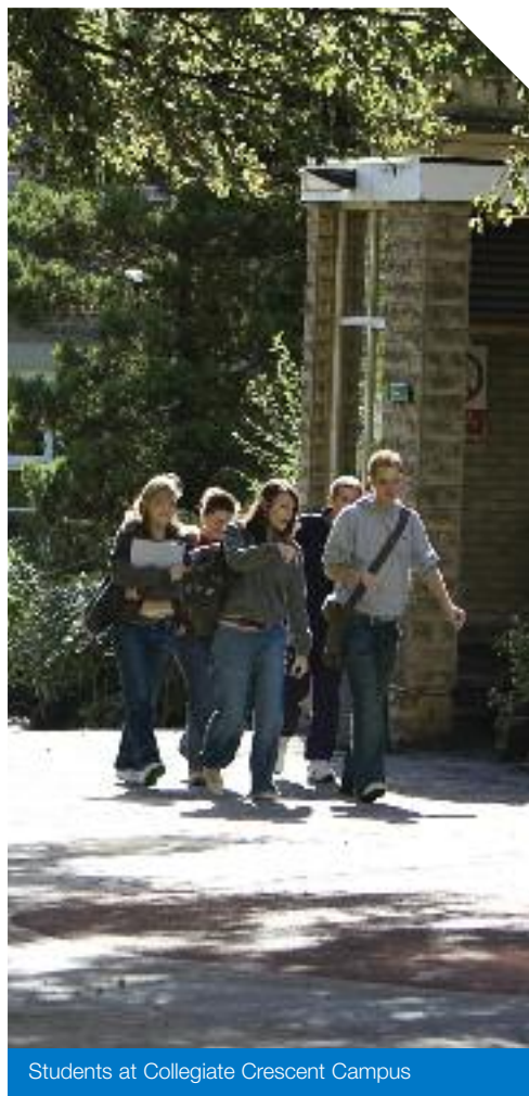
Students at Collegiate Crescent Campus