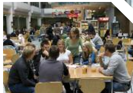
Students at Heartspace, City Campus