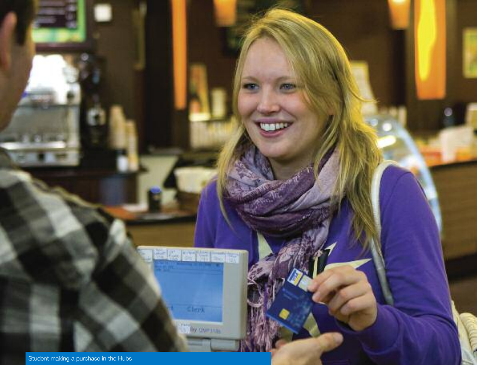
Student making a purchase in the Hubs