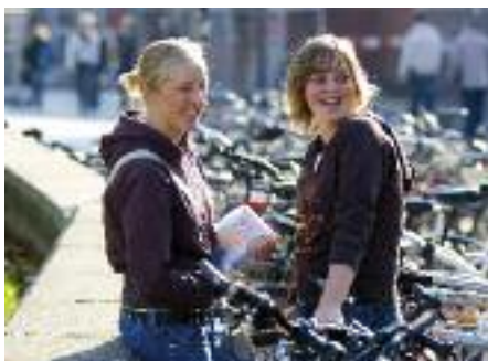
Students at Hallam Square, City Campus