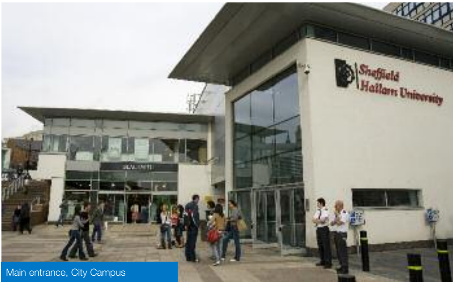
Main entrance, City Campus