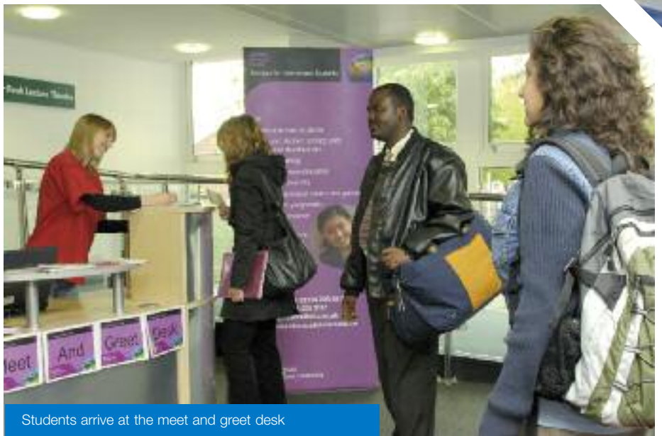
Students arrive at the meet and greet desk

‘The international student support team were very helpful. They were very friendly and answered all my questions very patiently. I am really thankful to them.’