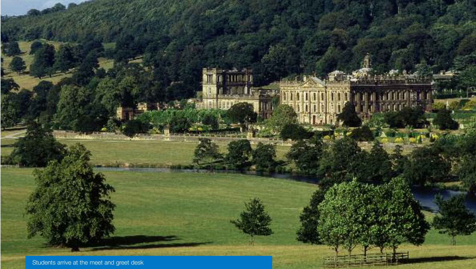
Students arrive at the meet and greet desk