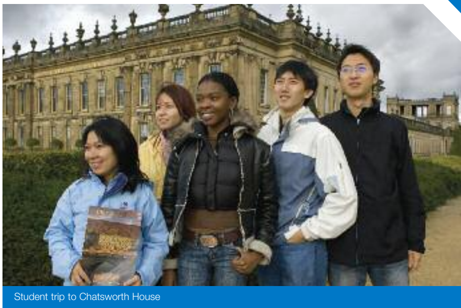
Student trip to Chatsworth House