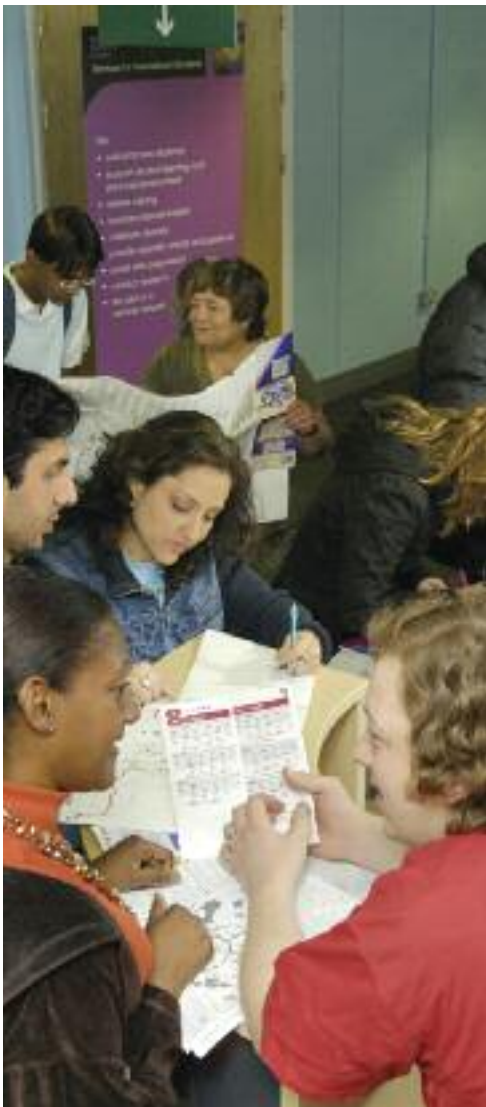
A student receives help at the meet and greet desk