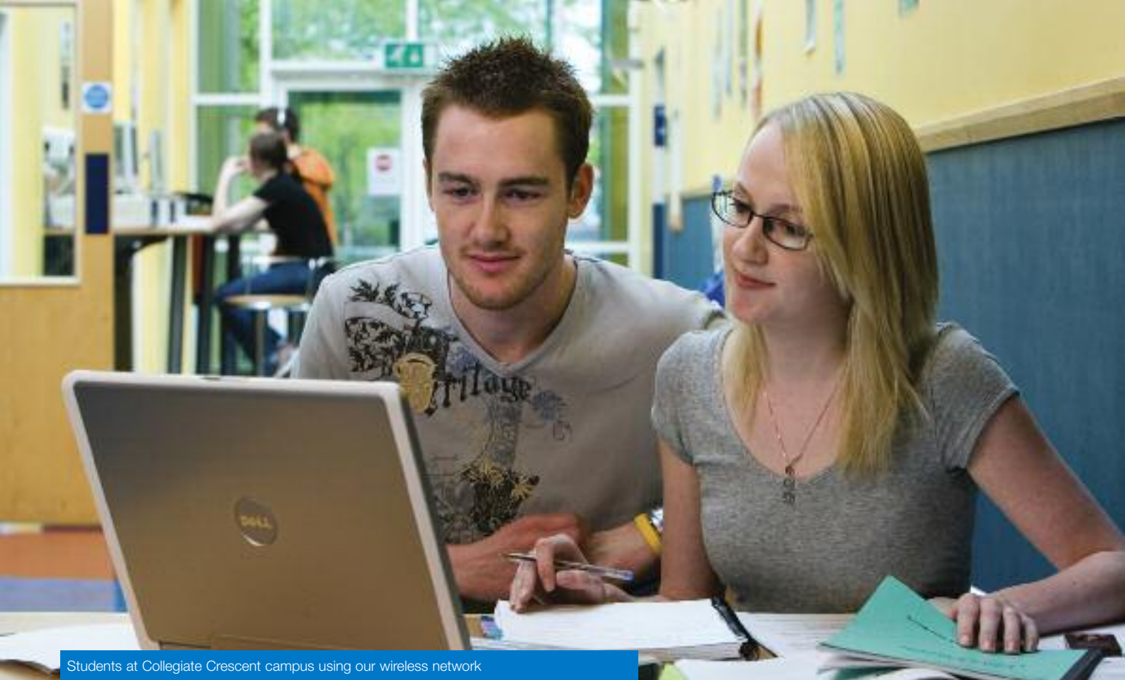
Students at Collegiate Crescent campus using our wireless network