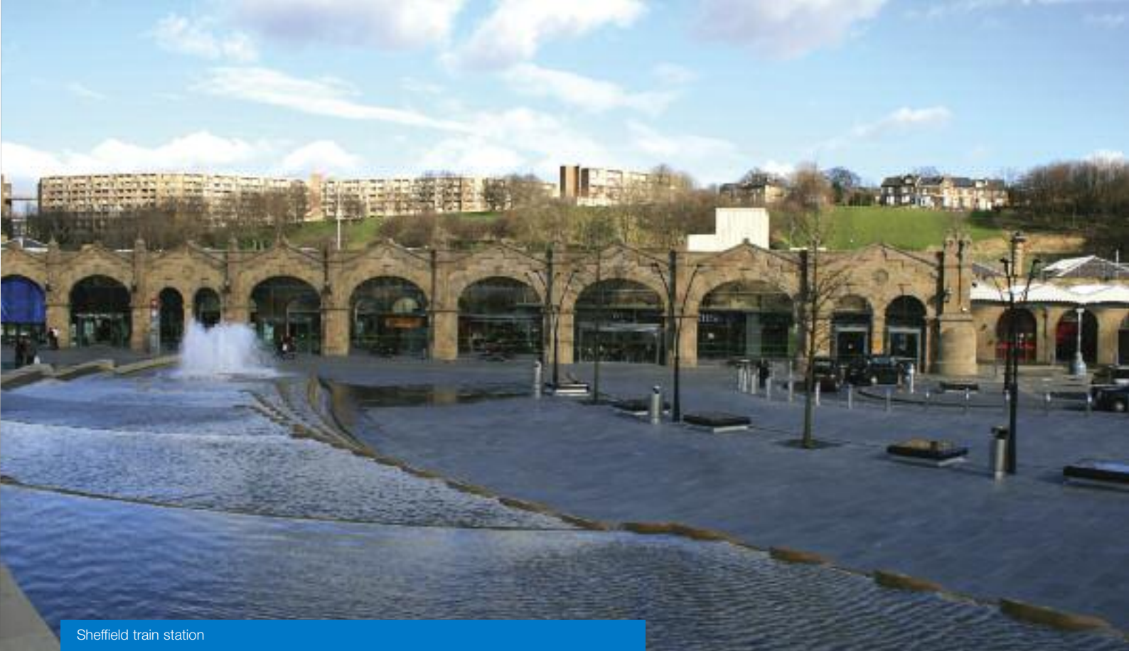
Sheffield train station