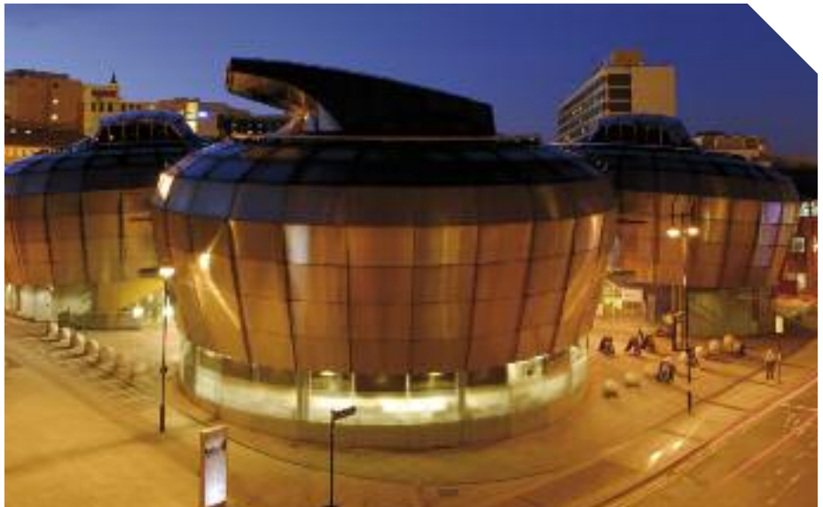
The HUBS – our Students' Union building

The Sports Union runs over 35 sports clubs that are both competitive and social. Many of the teams play in the highest leagues in England and lots of clubs are part of a thriving social scene. There are also around 30 societies , covering groups and interests from religion to rock music. The number of societies has increased enormously and there are plenty of opportunities and support for you to start a new society.