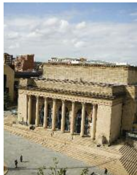
Sheffield City Hall, Sheffield city centre

Many students hope they will be able to find a full-time job in the UK after graduation. This may be difficult to achieve. There are some schemes, such as the Post Study Work Scheme, which allow graduates to work in the UK for two years. For details please visit the website in ' More information .'