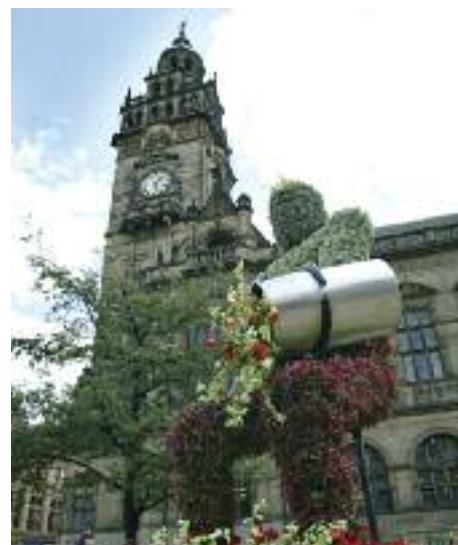
Sheffield Town Hall, Sheffield city centre

Allocation of accommodation is based on availability and your preferences as stated on the SA1 application form. Accommodation will be allocated only to students who have accepted an unconditional offer of a place to study at Sheffield Hallam University and who have successfully obtained a visa to study here.