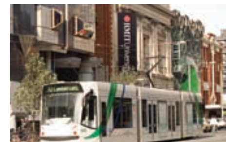
RMIT City campus

For more information visit the Education Abroad Office web site. www.rmit.edu.au/international/educationabroad