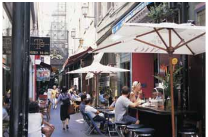
One of Melbourne's famous laneways