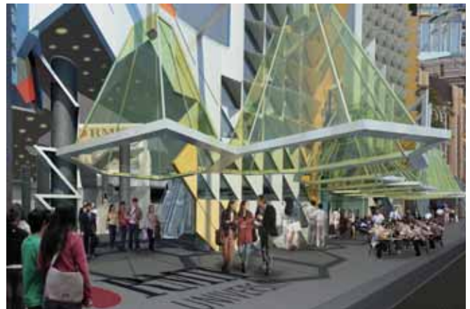
The striking Swanston Street entrance to the Swanston Academic Building which is set to transform the northern end of the CBD