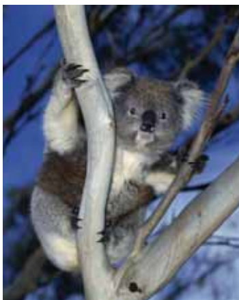
Come and see the koalas!

To check if your institution has an agreement with RMIT go to the following web page: www.rmit.edu.au/globalpassport/exchangepartners