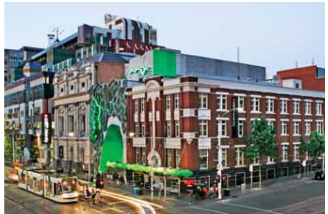
RMIT University City campus, Melbourne

RMIT has recently embarked on a three-year, AU$500 million investment in student learning and research facilities.