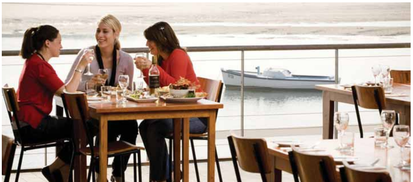
Dine by the seaside-Barwon Heads, The Great Ocean Road.