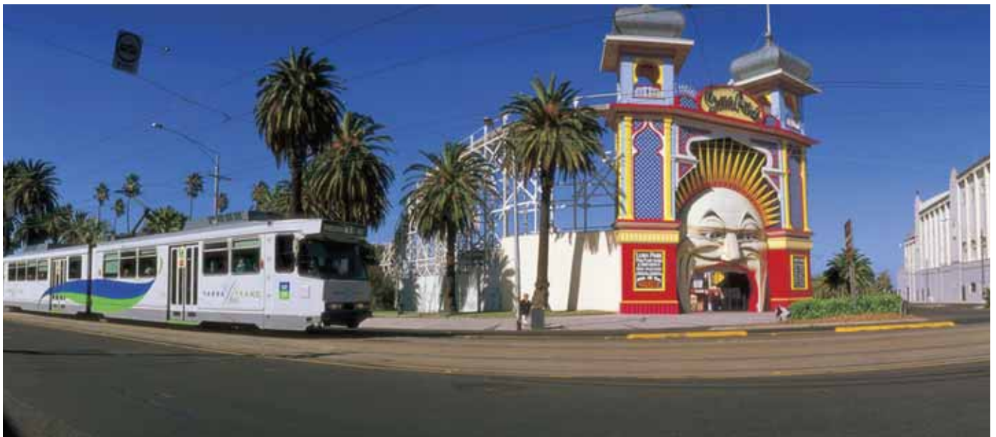
Have fun at St Kilda's Luna Park amusement centre