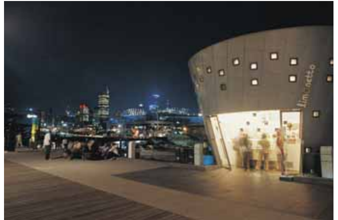
Waterfront dining and shopping at Melbourne Docklands

Melbourne, voted one of the world's most liveable cities, is also Australia's cultural hub. As the events capital of Australia, Melbourne is a sophisticated, modern and friendly city which also has a reputation for embracing the arts. Cafés, theatres, galleries, sporting venues and a network of parks and gardens—Melburnians have everything available to them. What's more, RMIT University is located in the centre of it all!