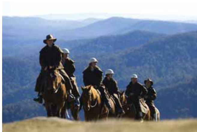
Go horse riding at Mt Stirling—Victoria's high country