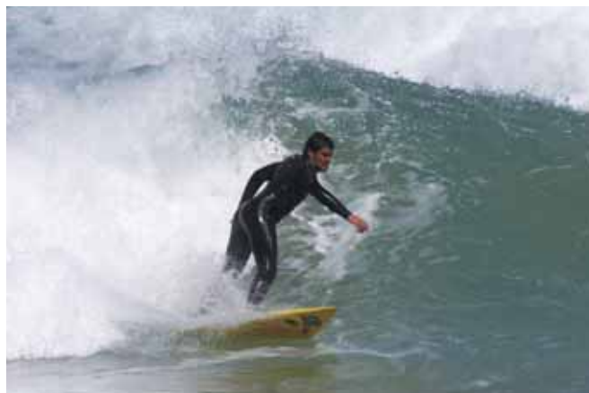
Learn to surf at Wilson's Promontory