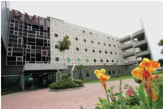
Ho Chi Minh City campus