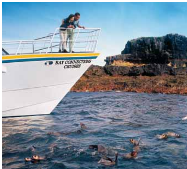
Seals at Phillip Island