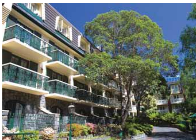
RMIT Village Old Melbourne