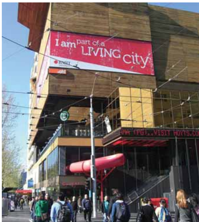
Melbourne Central shopping mall, opposite RMIT University City campus.

You will have widened your educational experiences, improved your employment prospects, and developed skills that will serve you well in an international workplace.