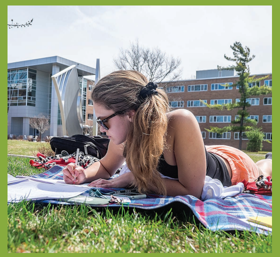
Student studies outside near Brody Square

On-campus living proves to be a smart move, too, as national research shows that students who live on campus are more academically successful and more connected to the campus community.