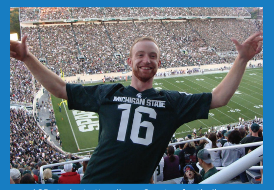
ASP student attending a Spartan football game