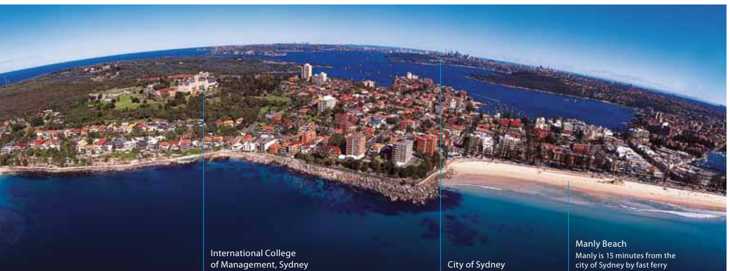
International College of Management, Sydney