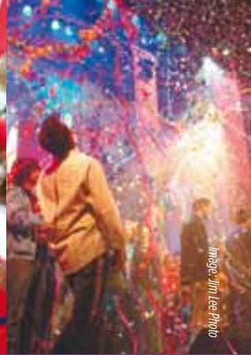
Melbourne International Comedy Festival