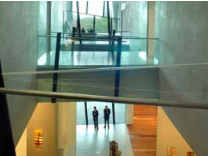
The Ian Potter Centre: NGV Australia