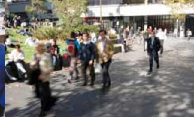
State Library of Victoria