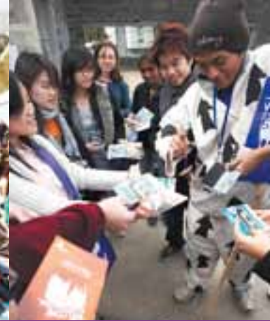
Welcome to International Students