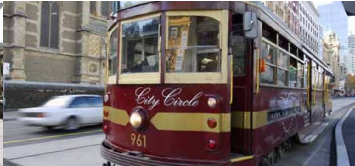
City Circle Tram