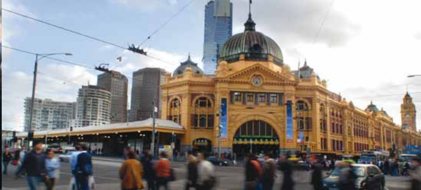
Flinders Street Station