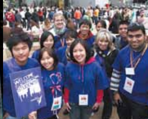
Welcome to Internationals Students