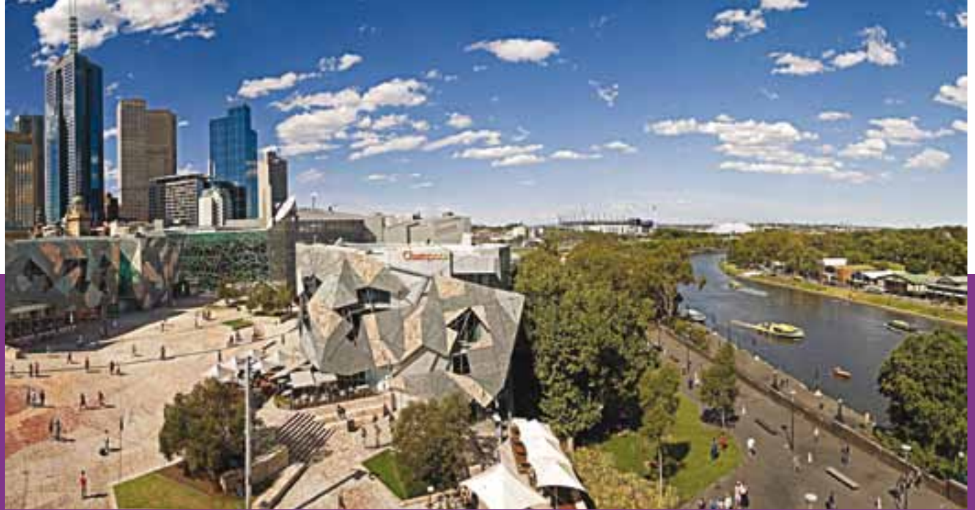
Federation Square and Yarra River