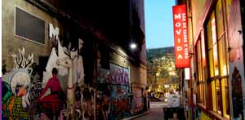
Movida Bar De Tapas