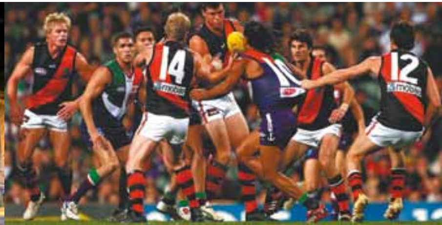
Australian Rules Football