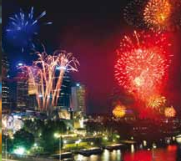
New Year's Eve