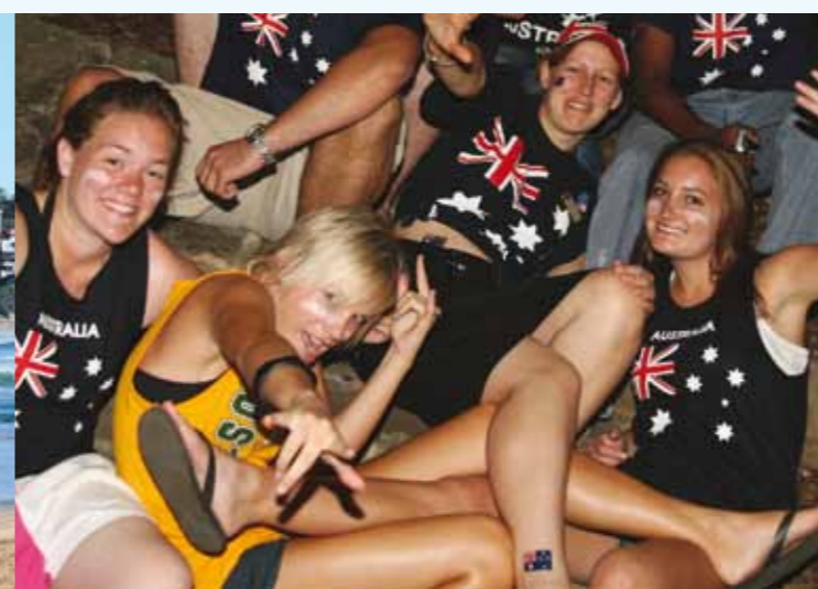
ICMS students come from over 40 countries