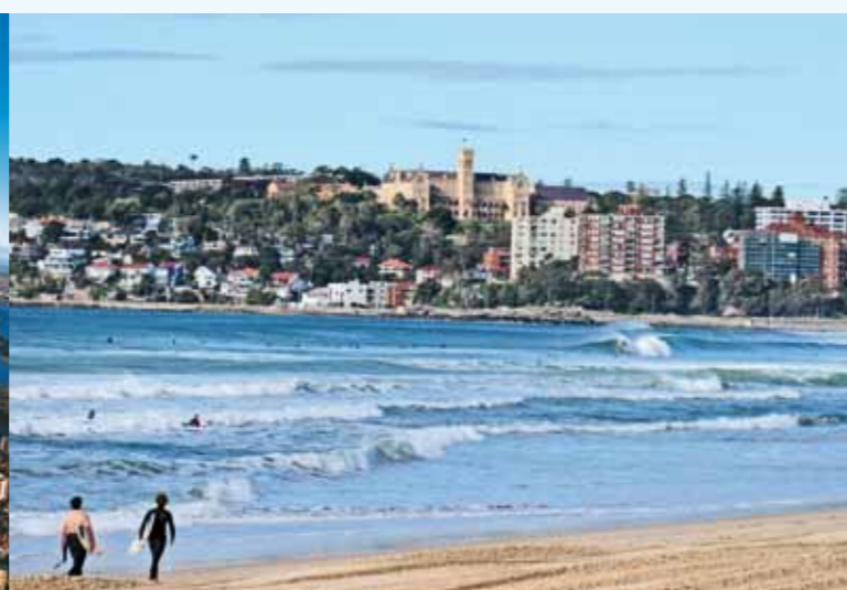
The ICMS Campus overlooking Manly Beach