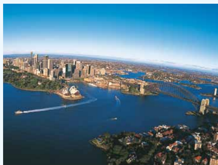
Manly is just 30 minutes from Sydney City by ferry