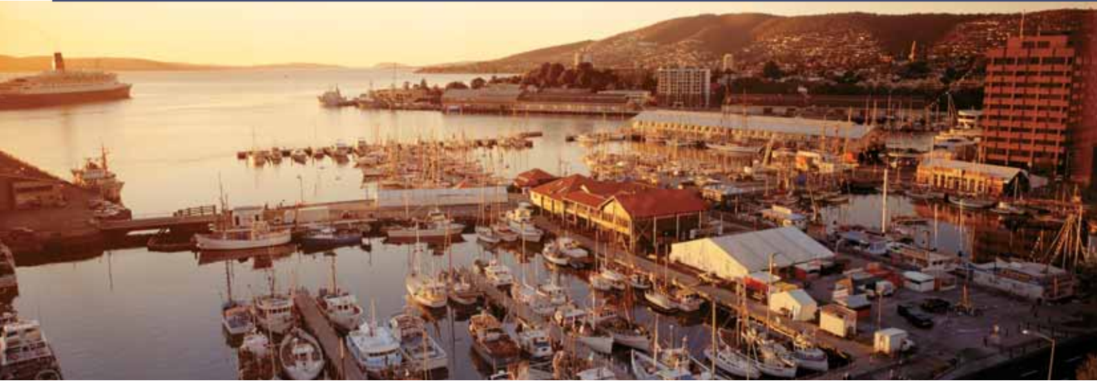
Hobart Waterfront

Hobart is Tasmania's capital. Situated close to the mouth of the Derwent River and in the foothills of Mount Wellington, it seems that nearly every home and office has a view of the harbour or the mountain. Excellent public transport takes you from the city centre and its clubs, theatres and cinemas to the base of Mount Wellington to spend a day walking in the bush or to a nearby ocean beach.