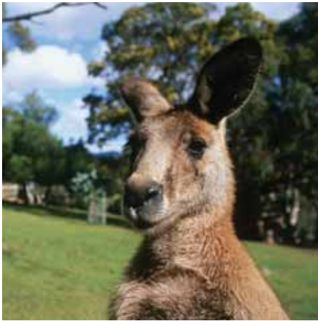
Forester Kangaroo

From wallabies to wombats, this is your chance to see Australian animals in the wild – and the Narawntapu National Park on the north coast of Tasmania is a wildlife haven. Picnic with potoroos while watching forester kangaroos hop on past. You might even catch a glimpse of a Tasmanian devil if you wait till after the sun sets.