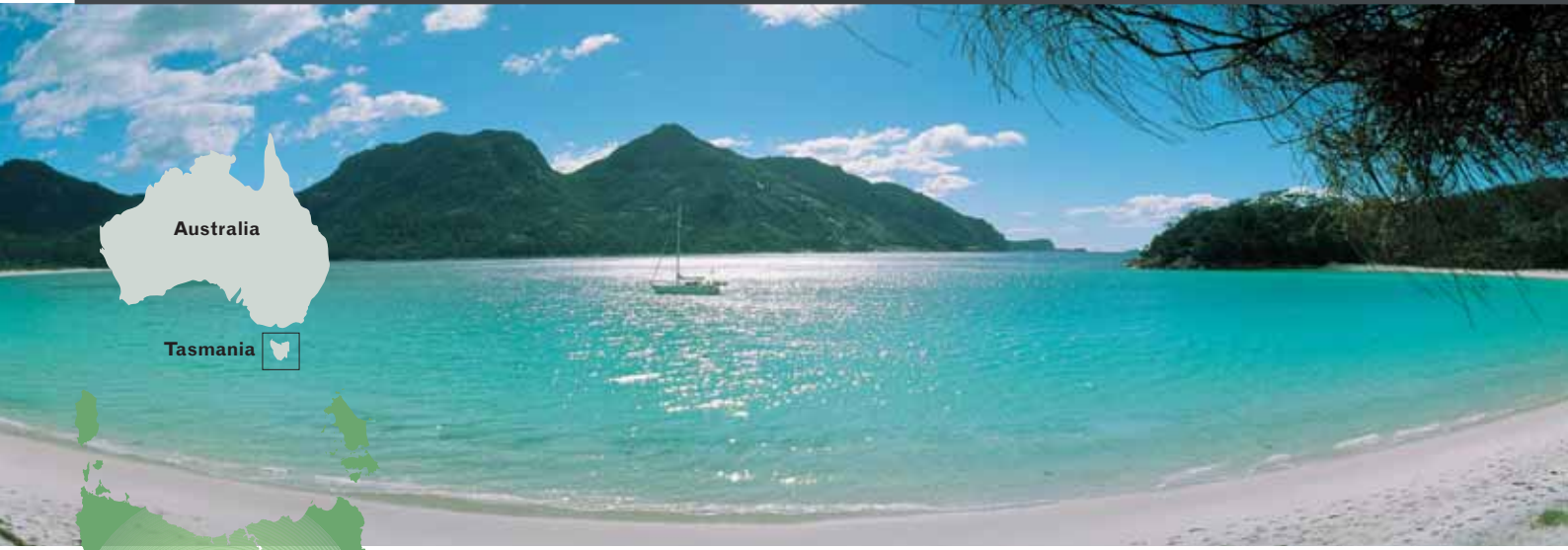
Wineglass Bay