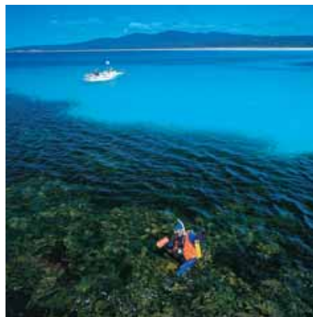
Bay of Fires

In 1997, National Geographic published a special issue on the treasures that lay "Beneath the Tasman Sea." Much of the marine life discovered at the depths of the ocean cannot be found elsewhere on Earth. Not only is the marine life unique but shipwrecks that went down during the early settlers and convict period can be explored off the coast of the Tasman Peninsula.