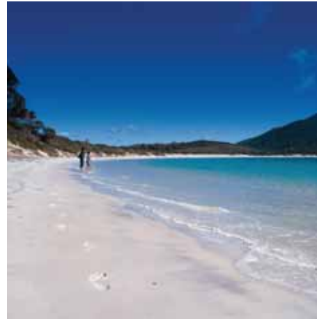
Wineglass Bay

For fitness freaks and ocean lovers a great way to take in the breathtaking scenery on the East Coast of Tasmania is to bike and hike it! There is a major road that winds right alongside the coast for nearly 200 kilometres. National parks such as Douglas-Apsley and