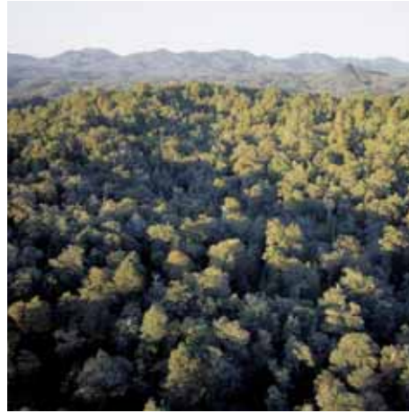
Tarkine Myrtle Forest

The Tarkine encompasses 350,000 hectares of the largest piece of wilderness left unprotected in Tasmania. Camp out in the rainforest, or stargazers may prefer to sleep on sandy beaches under the Southern Cross.