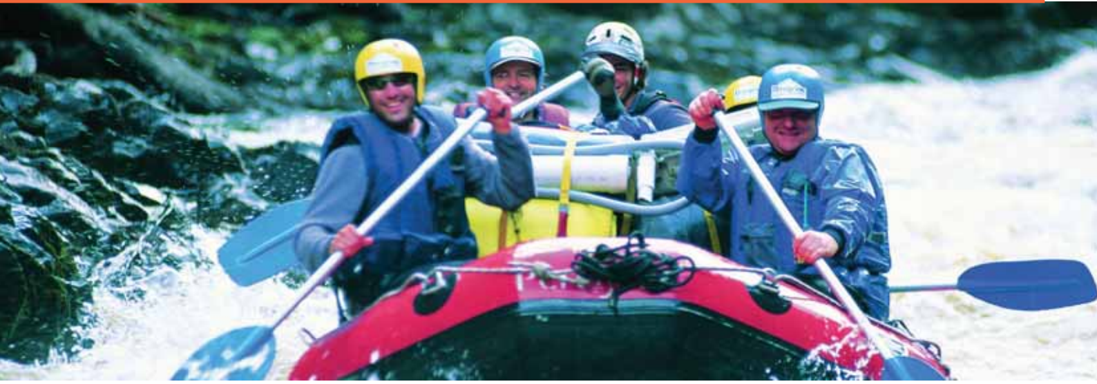
Franklin River