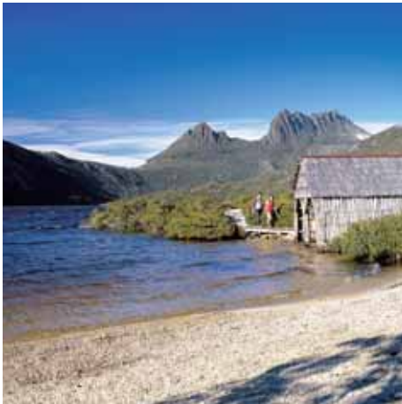
Cradle Mountain

If hiking is your pleasure, it's called bushwalking here and in Tasmania you can't get enough of it. From easy two-hour walks around Dove Lake to five-day, hard-core hikes over the world famous Overland Track, Cradle Mountain National Park is a favourite for nature