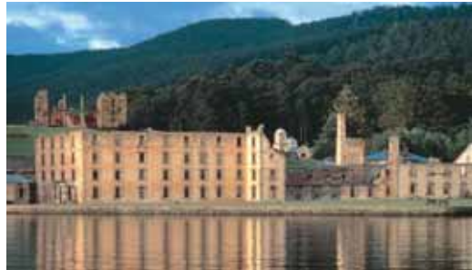
Port Arthur Historic Site

Tasmanians have the luxury of experiencing four distinct seasons. The seasons are tempered by the surrounding sea and temperatures are rarely extreme. In winter you'll see snow-capped mountains but rarely find a snowflake fall at your feet in the city, with the average temperature being 13 degrees Celsius. Summer brings warm weather, inviting people to enjoy the beaches, and the humidity is low so the heat is rarely oppressive. The average temperature is 23 degrees Celsius. Spring and autumn boast mild temperatures and are seasons of extraordinary beauty around the entire island – lavender fields blossom in the spring and the native beeches are a 'must see' in the autumn.