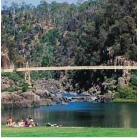
Cataract Gorge

With its scenic walks, picnic grounds, chairlift, swimming holes, cafes and wildlife, the Gorge in Launceston is a picture-perfect place to spend a lazy Saturday afternoon. Or, for the adventure enthusiasts, you can try your hand