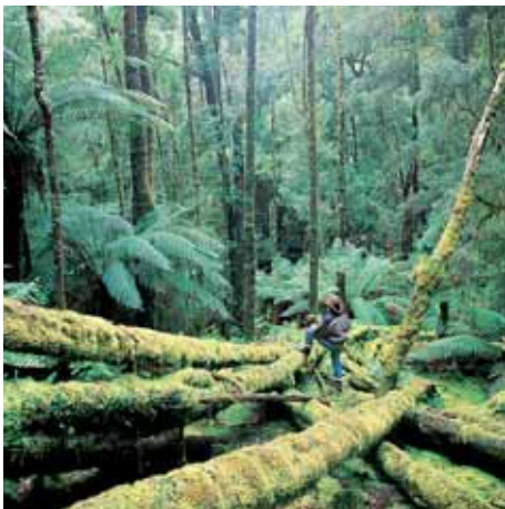
Bird River

Conservation Volunteers Australia is Australia's largest practical conservation organisation managing more than 2,000 conservation projects across Australia each year. The CVA has offices in both Hobart and Launceston and invites you to explore more of