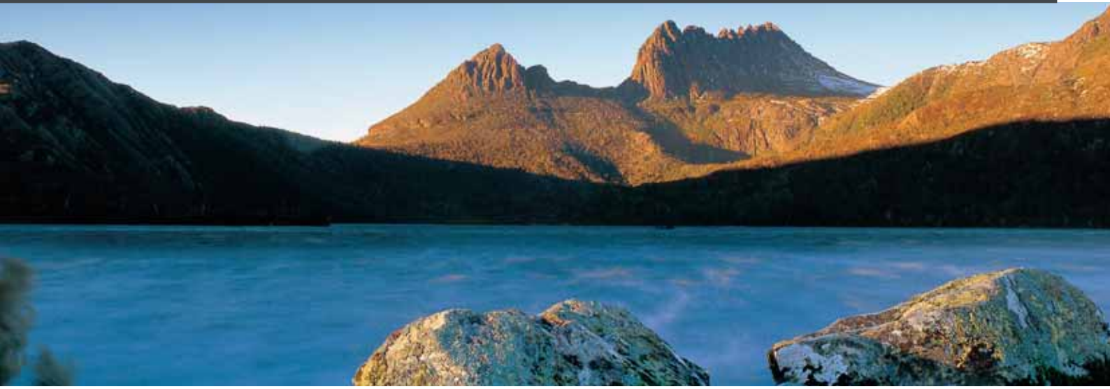
Cradle Mountain