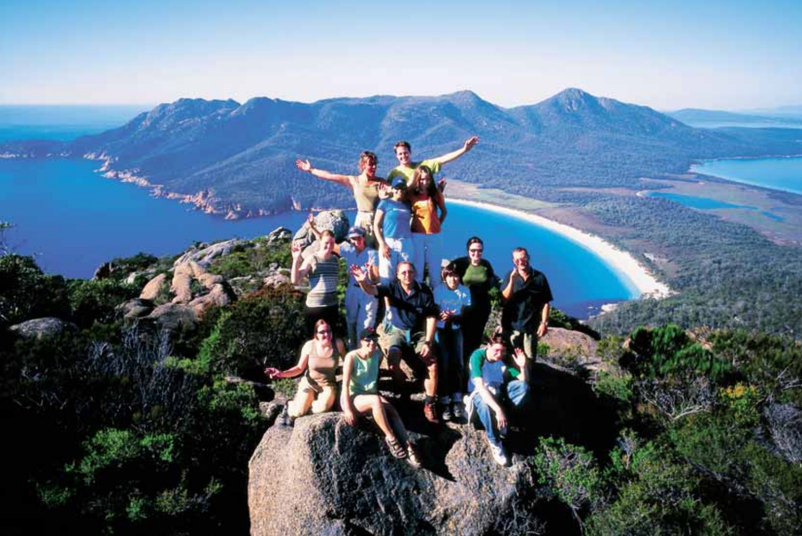
Mt Amos - Wineglass Bay