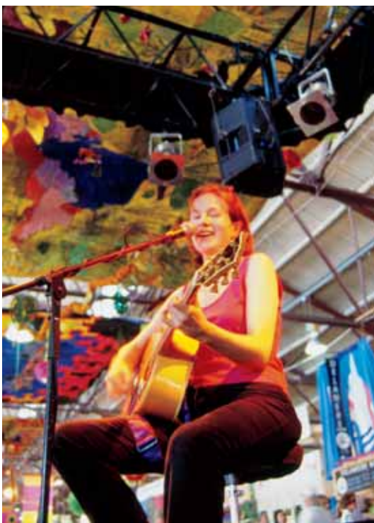
Hobart Summer Festival