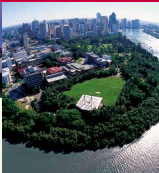
AERIAL SHOT OF GARDENS POINT CAMPUS AND BRISBANE CITY