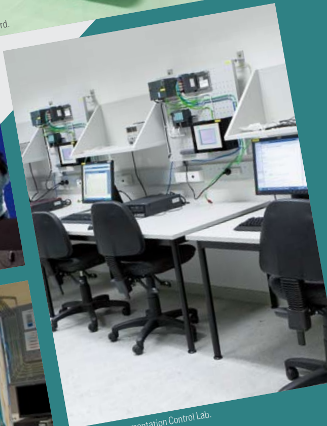
SIEMENS Instrumentation Control Lab.