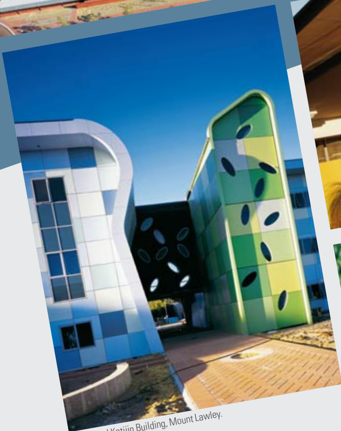
Kurongkurl Katijin Building, Mount Lawley.