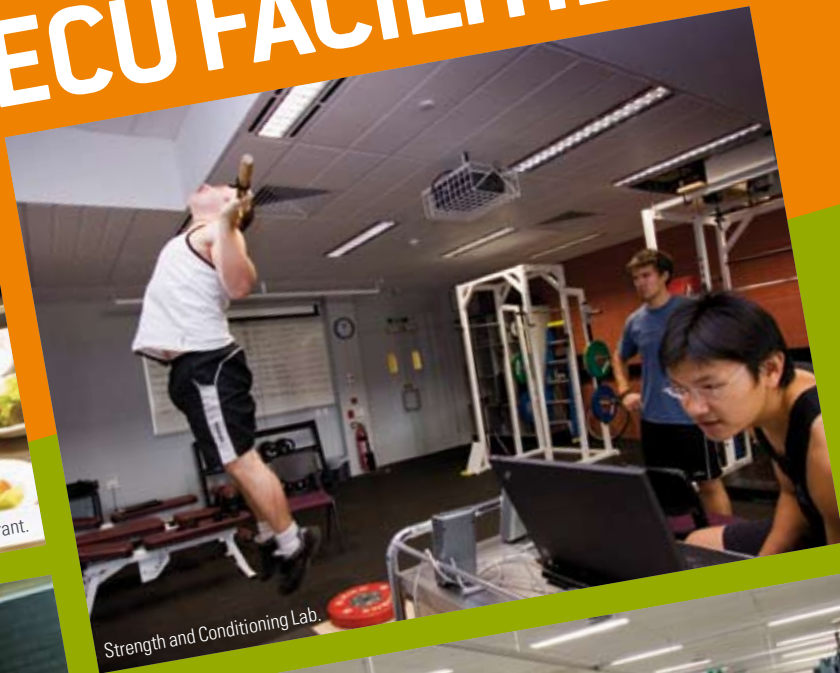
Strength and Conditioning Lab.