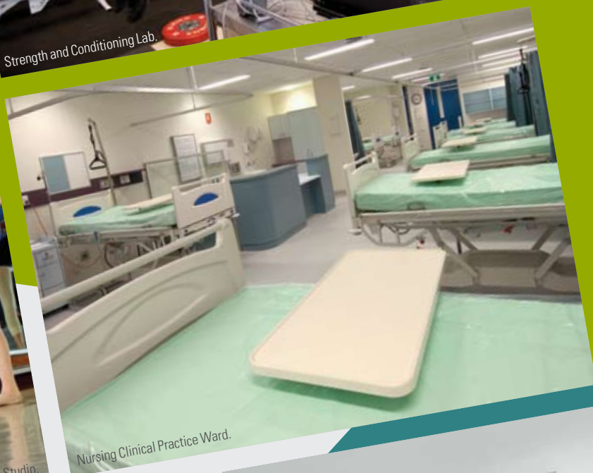
Nursing Clinical Practice Ward.