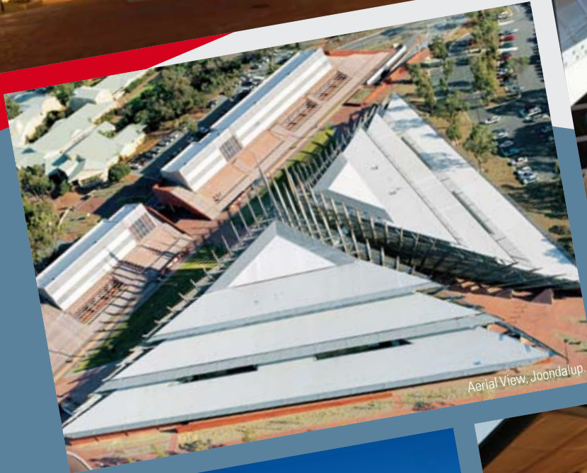
Aerial View, Joondalup.