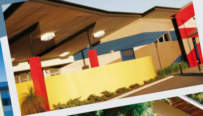
Education Building, Mount Lawley.