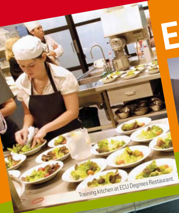
Training kitchen at ECU Degrees Restaurant.